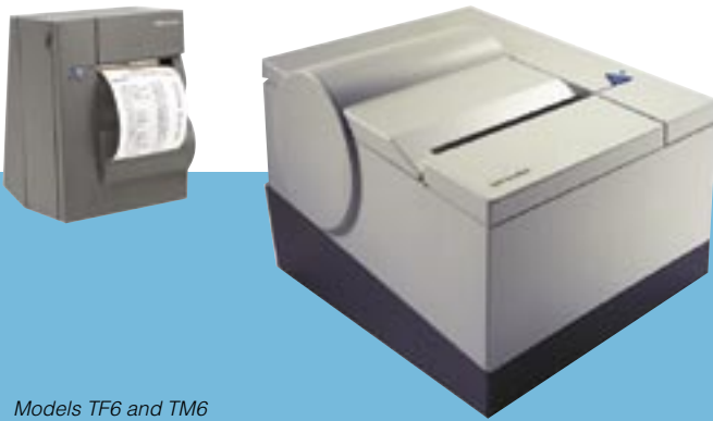
Models TF6 and TM6