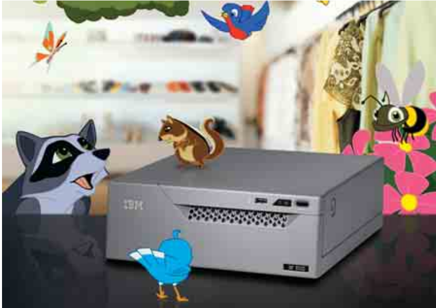
IBM SurePOS 300 Series