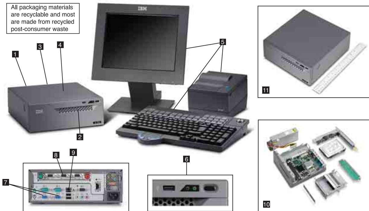
IBM SurePOS 300 system with optional IBM modular CANPOS (Compact AlphaNumeric Point-of-Sale) keyboard, IBM SureMark single-station printer, IBM SurePoint 12" display

than 30 years. With 2.5 million POS terminals installed in over 100 countries, IBM is the global leader in point-of-sale. Retailers know they can depend on IBM technology and leadership.